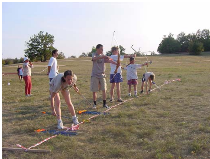
Kids competition– part of the running lap at background