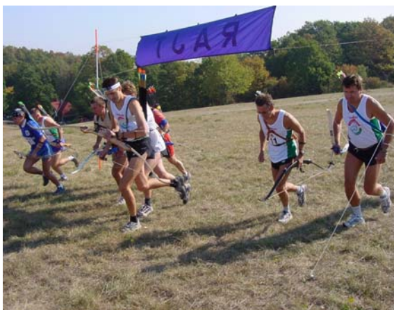
Start in one of the first rounds