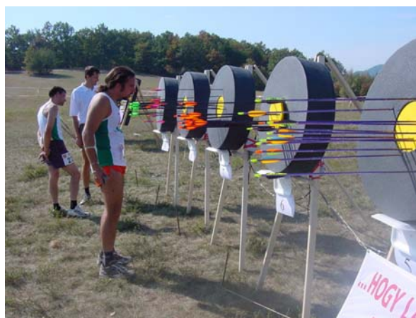
Hit and miss targets