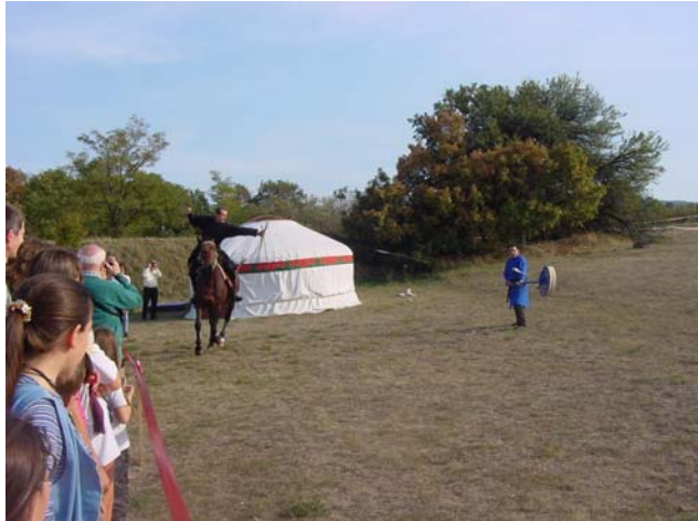
Horse Archery show