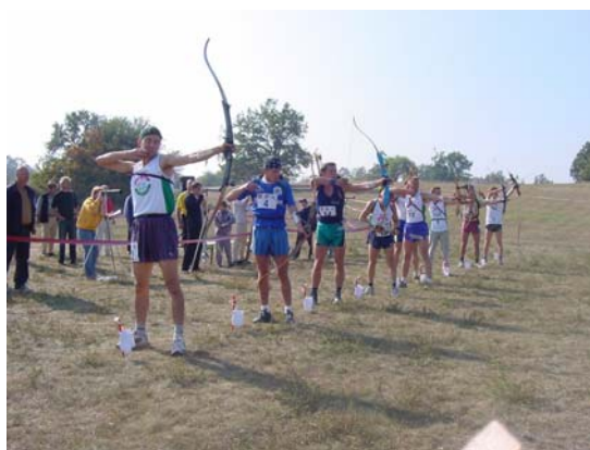
On the shooting line (Final event)