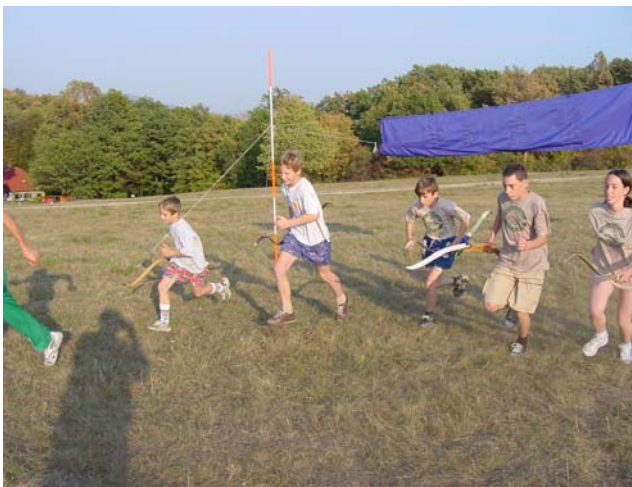
Kids Competition – Start